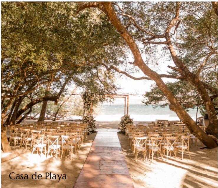
Casa de Playa